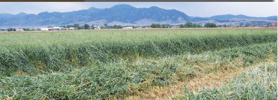
WINTER CEREAL FORAGE TRIAL/FORAGE YIELD TONS PER ACRE

RAY is awnless with similar forage yields to Willow Creek. It is the first forage winter wheat with true, dual use potential! Plant at a target plant population of 1 million viable seeds per acre on dryland.