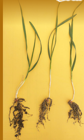
Foothold & Awaken Untreated Check Teraxxa F4 Relenya

DYNA-SHIELD® FOOthold® VIROCK® is a combination of the insecticide Imidacloprid and the three fungicides Metalaxyl, Tebuconazole and Fludioxonil for early season protection of seedlings against insect injury and soilborne diseases for barley and wheat.